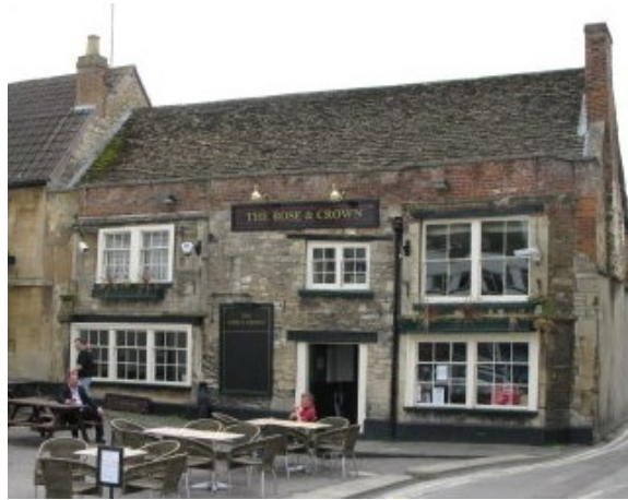
The Rose and Crown, 22 Market Place, Chippenham as it is today.