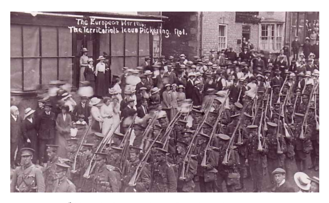
5<sup>th</sup> Yorkshire Regiment leaves Pickering in August 1914

When he signed the papers his age was 16 years and 350 days. According to the photo from the Malton Gazette he was stationed at Darlington. This was probably one of the training bases used by the Territorial Battalion.