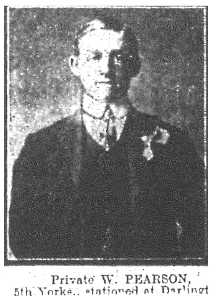
5th Yorks. stationed at Darlingt